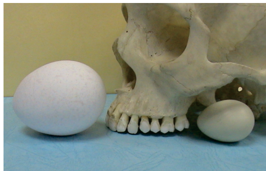
Figure 1 : Bird egg sinus lift model

The dental model is commonly used to introduce the dental student to the similar aspects of teeth morphology and surrounding anatomic structures. The practice in dental model is a major course in the dental school. Therefore dental model is familiar to the dentists. For this reason, we use a dental model and a bird egg to create a simulated model for sinus lift training (Figure 1). At first, we want to create an atrophy ridge with an enlarged maxillary sinus (Figure 2). The first step is to remove the maxillary and place the red self-curing resin into the socket. Then we trim the dental model to be a resorbed maxillary ridge and create a fossa like a maxillary cavity. Secondly, the bird egg was used to simulate maxillary sinus. After aspirating the substances of bird egg, it was sticking to the fossa by instant glue. Finally, a maxillary sinus lift prototype supporting by dental model was done. Subsequently, we can manipulate the maxillary sinus lift procedure by lateral window approach. You can create the bone window with No. 2 diamond bur to proceed to elevate the bone window and Schneiderian membrane with the surgical curettes (Figure 3). Then, you can put the bone grafting material into the maxillary sinus to increase the width and height of the alveolus.