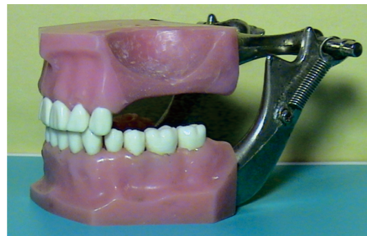
Figure 2 : Right: Chicken egg/Left: Bird egg